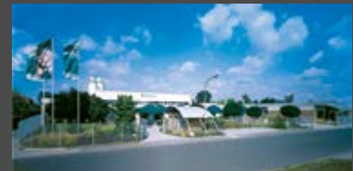
Silikal production and administration in Mainhausen, near Frankfurt/Main, Germany.

Contact us. We will be pleased to support you – free of charge and without any obligation for you.