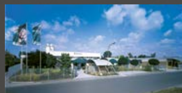
Silikal production and administration in Mainhausen, near Frankfurt/Main, Germany.

Contact us. We would be pleased to go into detail with you – at no cost or obligation to you, of course.